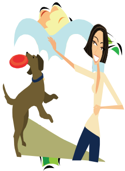
An off-leash dog park

The Hill's Bark Park is an off-leash dog park where dog owners can take their dogs to run free and socialize with others. This park is thanks to a group of women who