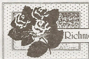
Richmond Rose Garden Project

Rejoice with us in the progress of the new Friendship Garden. Watch it grow and if you'd like to be a part of world peace, get on you knees, and help weed! ♦